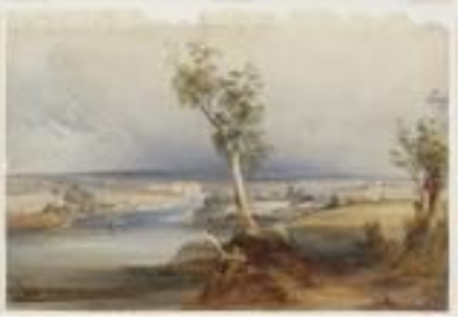
View of Parramatta, 1838, by Conrad Martens. Watercolour drawing