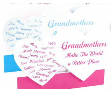
Grandmother Plaque $5.00