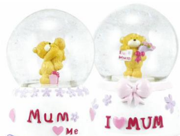
Bear Glitter Globe $5.00