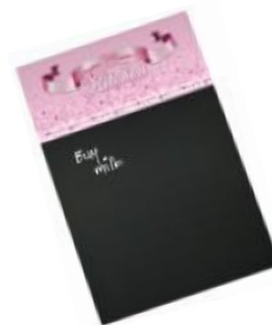
Metal Blackboard $6.00