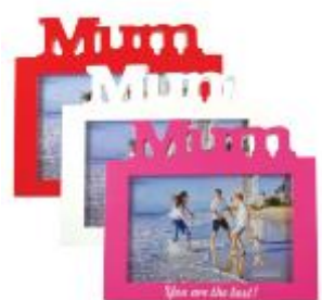
Best MumPhoto Frame $5.00