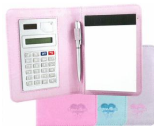
Calculator Compendium $6.00