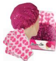
Shower Cap & Glove Set $5.00