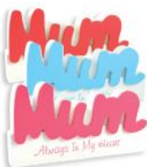
Mum Plaque $4.50