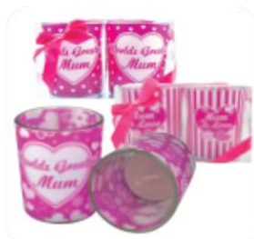
Mum Pink Candle Set $3.50