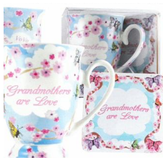
Grandmother Mug & Coaster $5.00