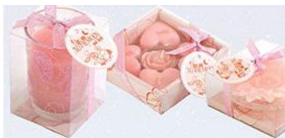
Scented Candles $3.00