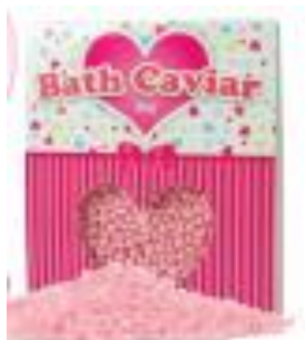
Bath Caviar $2.00