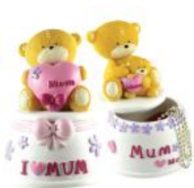
Bear Trinket Box $5.00