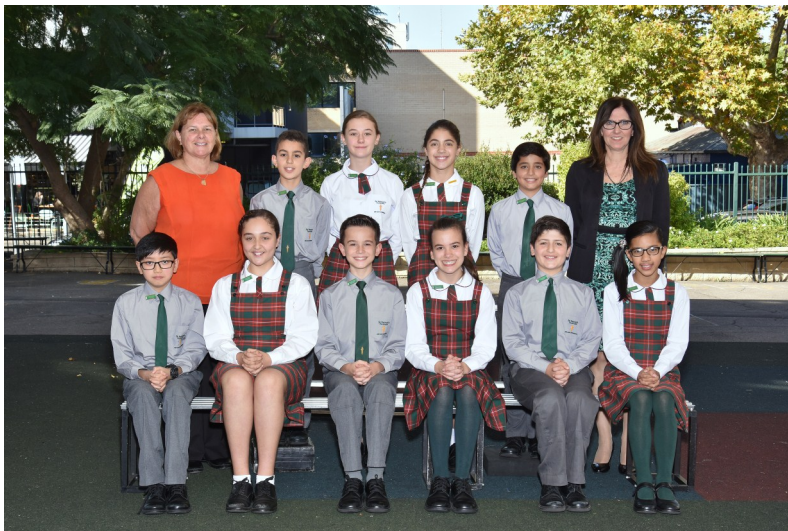
2016 Student Leaders