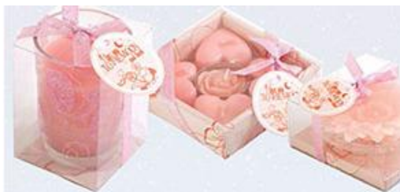
Scented Candles $3.00