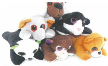
Cat / Dog Ring Holder $7.00