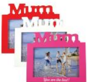
Best MumPhoto Frame $5.00