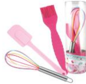
Kitchen Utensil Set $5.00