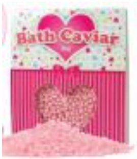
Bath Caviar $2.00