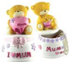
Bear Trinket Box $5.00