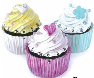
Cupcake Timer $6.00