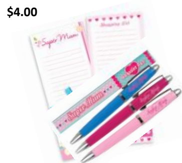
Shopping List & Pen Set $4.00