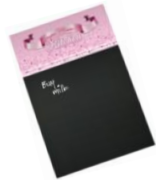
Metal Blackboard $6.00