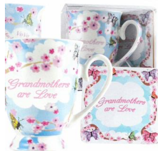
Grandmother Mug & Coaster $5.00