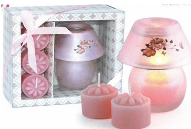
Porcelain Dome Tealight $7.00