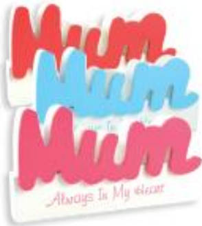
Mum Plaque $4.50