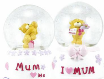
Bear Glitter Globe $5.00