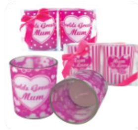
Mum Pink Candle Set $3.50