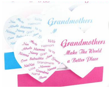
Grandmother Plaque $5.00