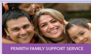
PENRITH FAMILY SUPPORT SERVICE