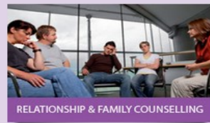
RELATIONSHIP & FAMILY COUNSELLING