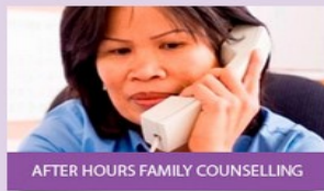
AFTER HOURS FAMILY COUNSELLING