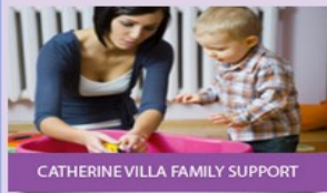
CATHERINE VILLA FAMILY SUPPORT