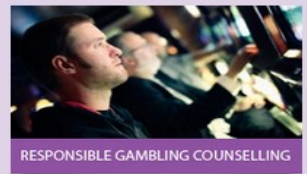
RESPONSIBLE GAMBLING COUNSELLING