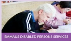
EMMAUS DISABLED PERSONS SERVICES