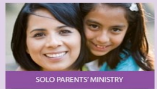
SOLO PARENTS' MINISTRY