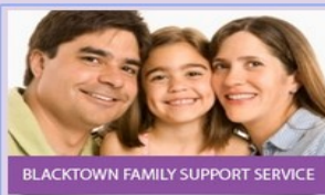
BLACKTOWN FAMILY SUPPORT SERVICE