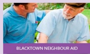
BLACKTOWN NEIGHBOUR AID